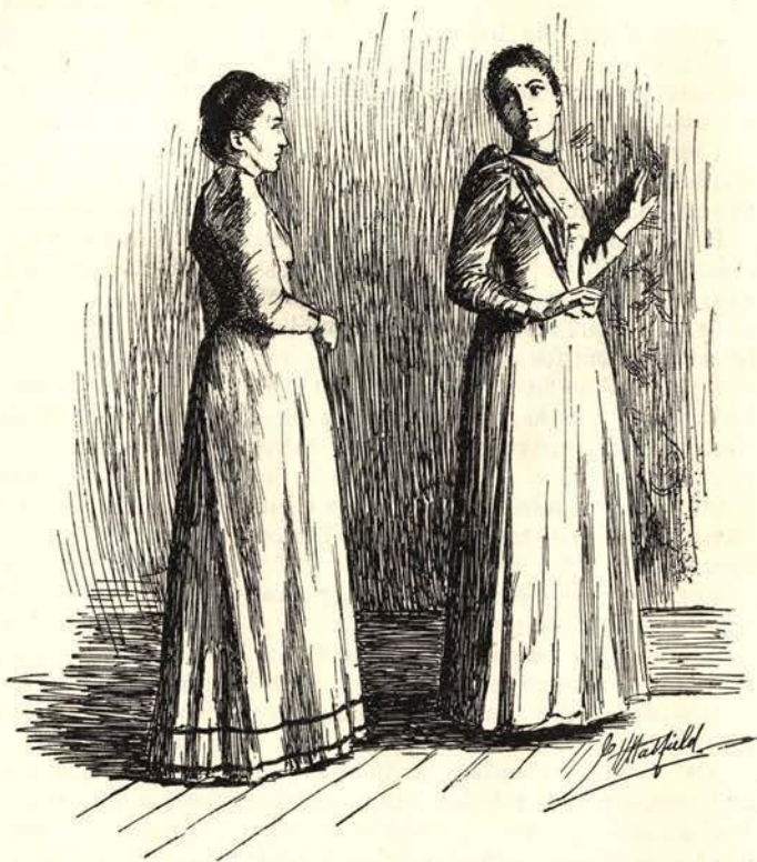
"She didn't know I was in the Room."